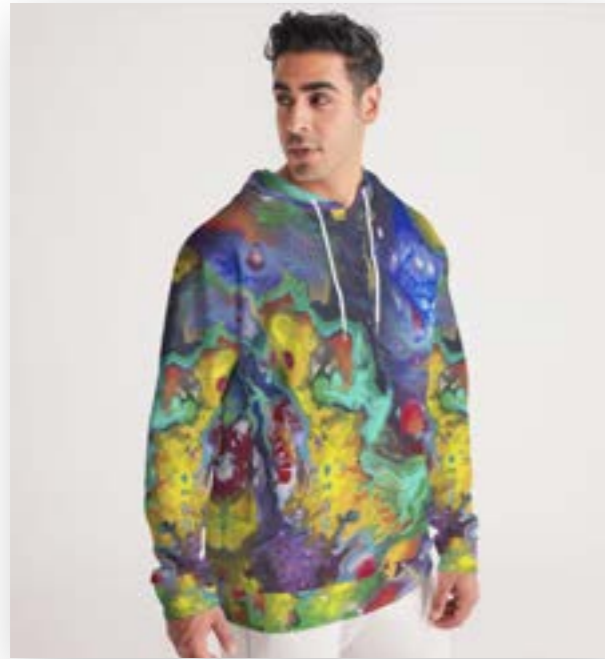
LUXURIATING IN INSPIRATION HOODIE